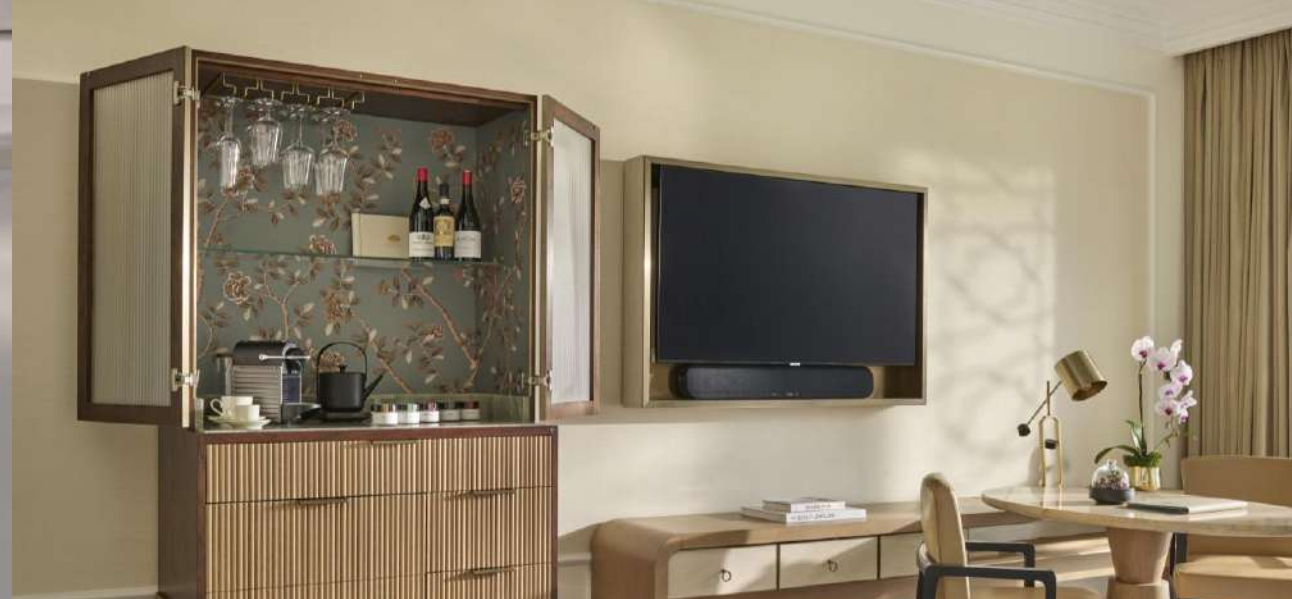
DELUXE ROOM CITY / GARDEN / GARDEN TERRACE/ SEA VIEW / CLUB SEA VIEW - 55 SQM / 592 SQF