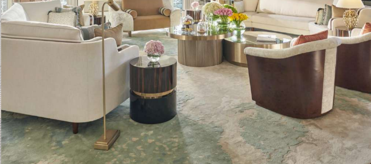
ROYAL SUITE / 280 SQM / 3,014 SQF / EXCLUSIVE ACCESS TO THE EP CLUB / 24-HOUR BUTLER SERVICE