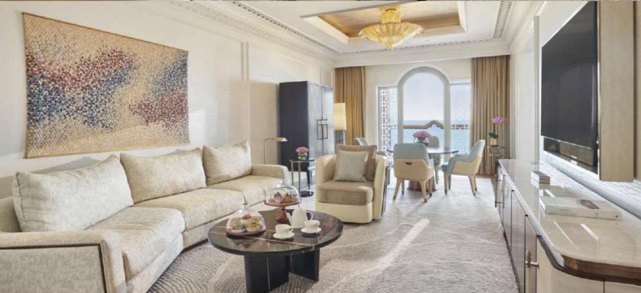
SEA VIEW SUITE / 110 SQM / 1,184 SQF / EXCLUSIVE ACCESS TO THE EP CLUB / 24-HOUR BUTLER SERVICE